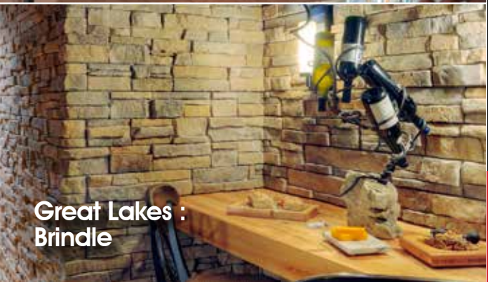
Great Lakes : Brindle