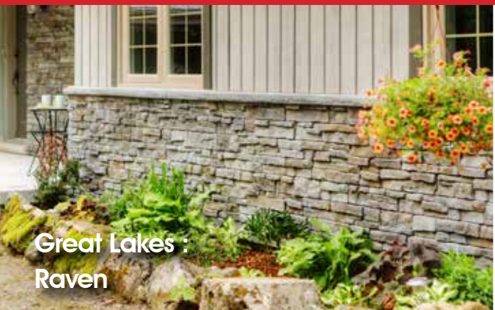
Great Lakes : Raven