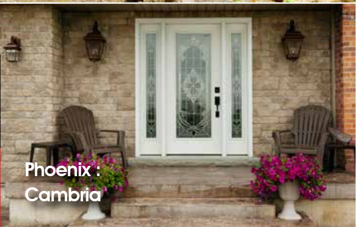
Phoenix : Cambria