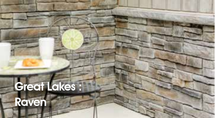
Great Lakes : Raven