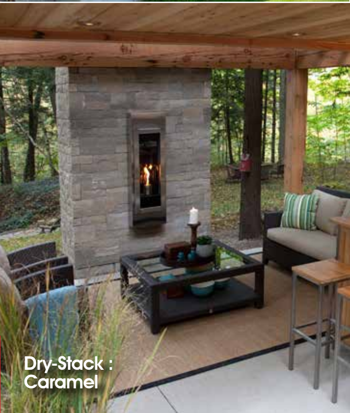
Dry-Stack : Caramel