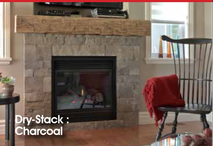
Dry-Stack : Charcoal