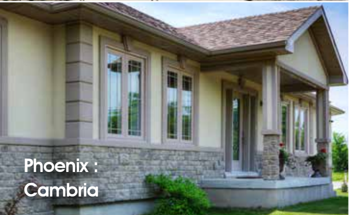
Phoenix : Cambria