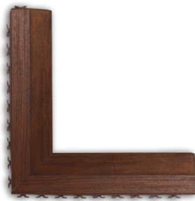
Inside Corner Pieces (two shown)