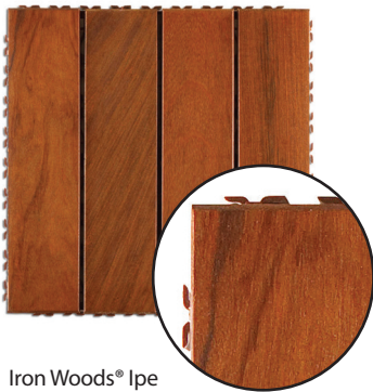
Iron Woods® Ipe 12"x12" Deck Tile (Top side)

Choose the right configuration for your project. Tiles are available in Iron Woods® Ipe.