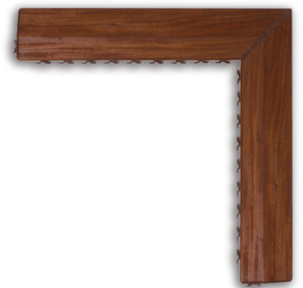
Outside Corner Pieces (two shown)